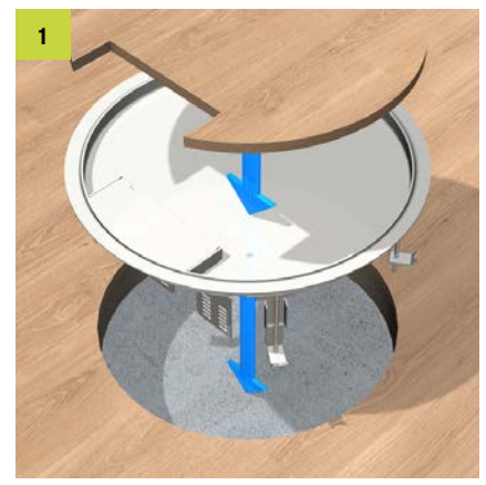
Cartridge installation unit Insert the cartridge installation unit (UEKDD R E) which is usable for up to three mounting boxes in the floor opening.

Cartridge installation units with a protective floor covering frame made out of stainless steel, round, with an outside diameter = 330 mm, for hollow space or false floors, with a clamping range from 40 to 80 mm. Usable for floor coverings with a thickness of 12 mm.